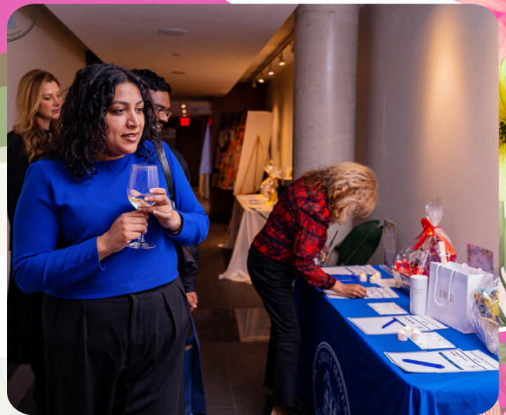
Our Silent Auction