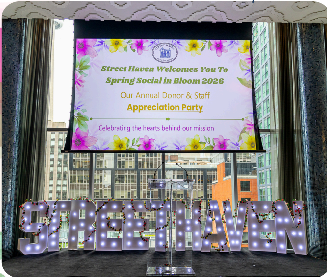
At the famous Tiff Lightbox