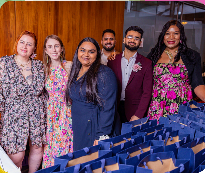
Street Haven's Social Committee